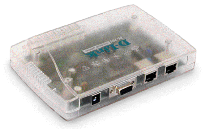
The D-Link DI-701 Residential Gateway protects your computers from hackers or unwanted users

By blocking ports that unscrupulous hackers use to penetrate a computer, the DI-701 will discourage a hacker from even attempting to break into your computer. Like a car or house alarm, the DI-701 will give you that added sense of security that petty thieves won't even try to break in.