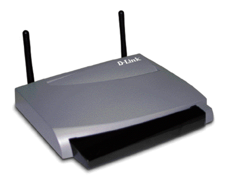
D-Link's DI-711 allows wireless LAN users to share a single Internet Connection while providing the safety and security of port blocking, packet filtering, and a natural firewall

For ISP, BSP, DLEC, and Cable Company distribution, the DI-711 can be configured with two levels of administrative control. A broadband provider can set the number of users, and change IP configurations remotely. Effectively it creates a separation between the provider's and user's networks to localize the effects of any local user's network settings and give the added benefit of NAT support to simplify the assignment and number of IP addresses on the provider's network. Remote configuration serves as a platform to increase the effectiveness of a provider's customer support, enabling fast and powerful remote diagnosis. Through the use of a single IP address, the user will additionally benefit from a single subnet, ensuring that as additional computers are provided with Internet access, they will still be able to network via TCP/IP locally, without needing any additional local gateways or routers.