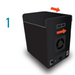
Pull up on the front plate.